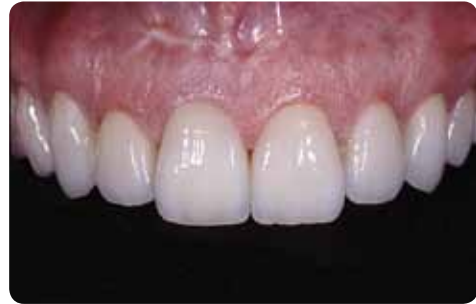
Complete dentures with IPS e.max Press Prof. Dr D. Edelhoff / O. Brix, Germany

Select, in cooperation with your laboratory, the suitable solution for the respective patient case: a cost-effective, fully contoured restoration as an economical and appealing alternative to a full cast crown. Or you can choose the more exclusive version fabricated by means of the cut-back and layering technique, which will meet even the most exacting esthetic requirements of your patients.